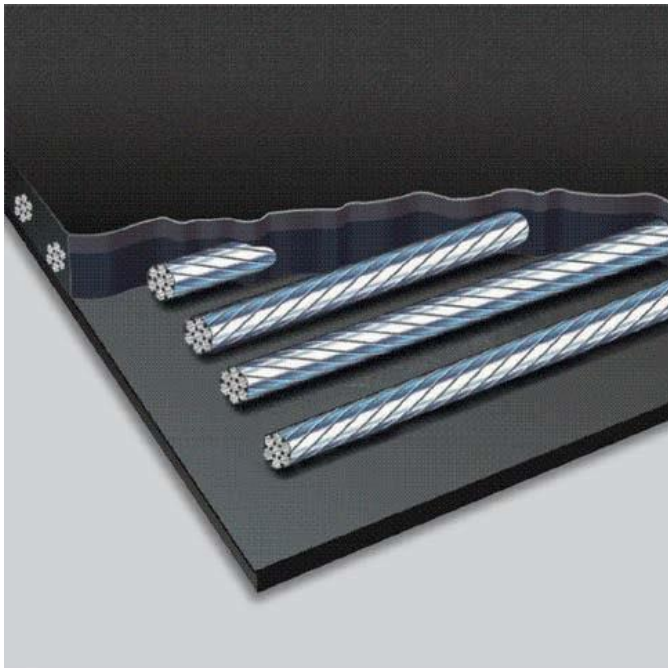
Steel cord construction

JACKS POWERCORD Steel Cord Conveyor Belt is developed by incorporating the most current technology with years of refinement to attain this technological precision. Every belt is designed to provide maximum performance and maximum life.